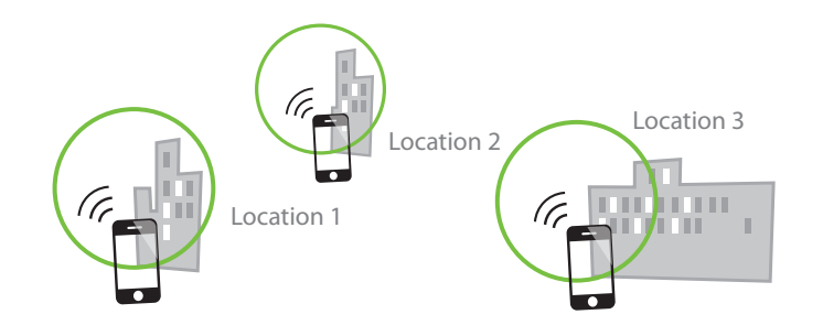
Deploy & Synchronise Wirelessly to Any Location, Any Time